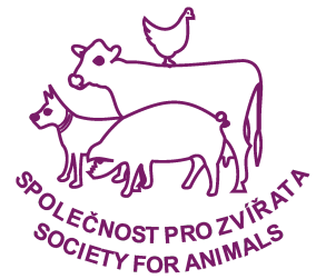
Společnost Pro Zvířata