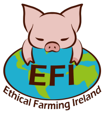
Ethical Farming Ireland